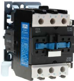
Model shown: CC34011**