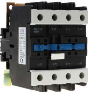
Model shown: CC495008**